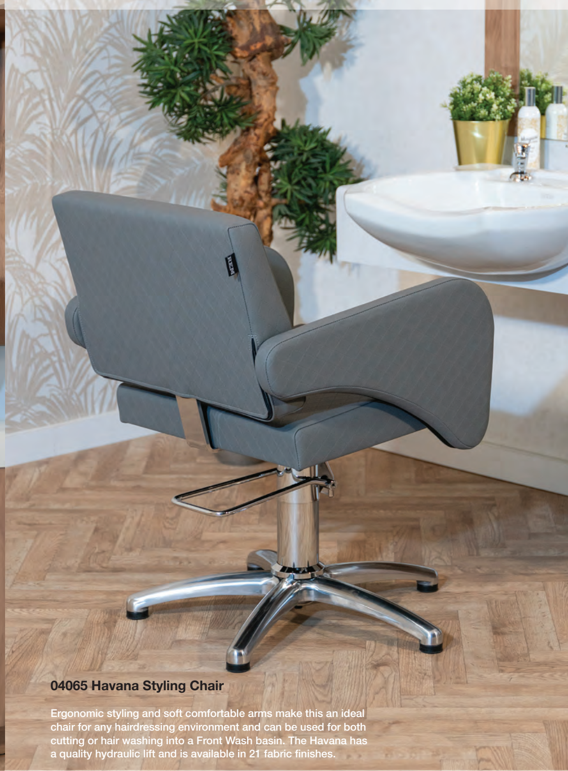
04065 Havana Styling Chair

Specifically designed for the Care Home Salon, the Pendle Easy Wash unit offers style and practicality. Its dual basin design with Frontwash and Backwash Ceramic basins enables DDA access for wheelchair users and has a styling mirror and open / closed storage with integral towel bin. The Pendle unit can be ordered in a combination of 21 hard wearing laminate finishes.