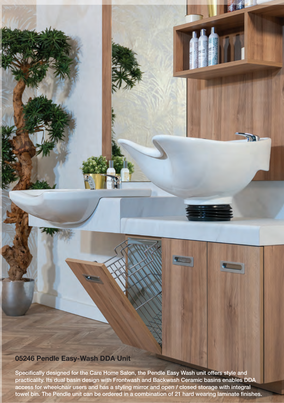
05246 Pendle Easy-Wash DDA Unit

Specifically designed for the Care Home Salon, the Pendle Easy Wash unit offers style and practicality. Its dual basin design with Frontwash and Backwash Ceramic basins enables DDA access for wheelchair users and has a styling mirror and open / closed storage with integral towel bin. The Pendle unit can be ordered in a combination of 21 hard wearing laminate finishes.